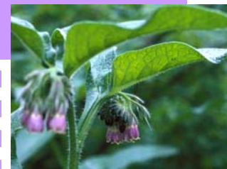
Comfrey - Symphytum Officinale L

This brew contains three excellent sources of iron: Nettle, Parsley, and Yellow Dock. It provides folic acid from the Parsley and vitamin B12 from the Comfrey. The green herbs all contribute vitamin C which aids iron absorption. The Mint makes it tasty. Enjoy!